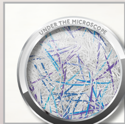
PAPER FIBRES REINFORCED WITH TEXTILE FIBRES

Textile fibres not only provide strength and reinforcement to cracked or crumbling surfaces but also provide additional resistance to shrinking whilst drying.