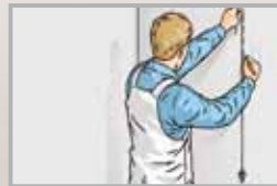
MARK OUT WALL

Strength and stability ensure TUFF STUFF is easy to use delivering perfect results that are resistant to expansion and shrinkage. We recommend paste the wall technique for speed but TUFF STUFF is perfectly compatible with conventional hanging techniques.