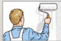
PASTE WALL OR PAPER