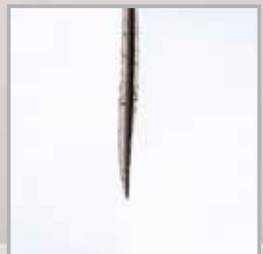
CRACKS AND TEARS CAN RETURN WITHIN DAYS.