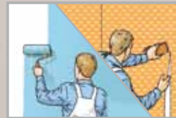
DECORATE WITH PAINT OR DECORATIVE WALLPAPER