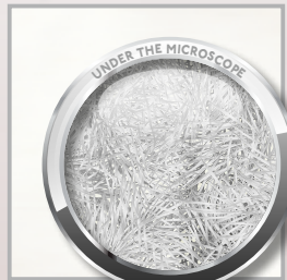
PAPER FIBRES ONLY